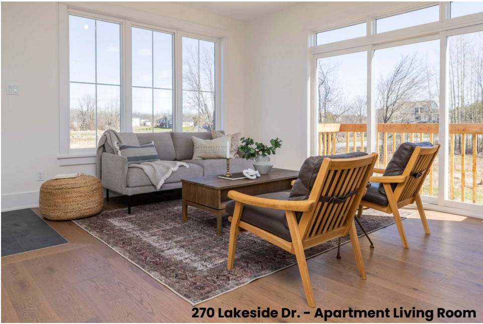
270 Lakeside Dr. – Apartment Living Room

The apartment side of this 2-in-1 bungalow offers a full living room, full kitchen, full bedroom, full bathroom.