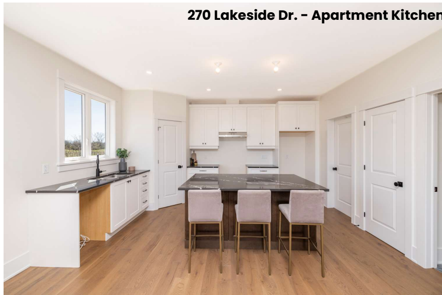
270 Lakeside Dr. – Apartment Kitchen