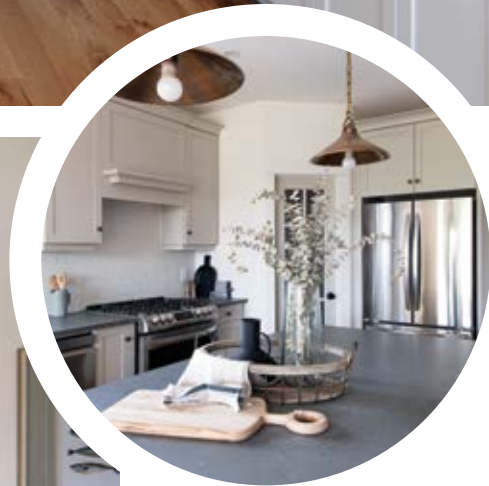
LEFT: City meets country with a live-edge dining table underneath contemporary light fixtures. ABOVE LEFT: This kitchen is highly functional, with lots of room for prep and a large walk-in pantry tucked in the corner. ABOVE: Quartz countertops have a leathered look, adding texture and dimension to the kitchen. OPPOSITE, TOP: A smart mudroom at the rear of the home proves that functional space can also be beautiful. BOTTOM: The second-floor loft is an amazing flexi-space perfect for work-at-home.

WHEN IT'S LEFT OPEN LIKE THIS, THE WORK-FROM-HOME ATMOSPHERE IS REALLY EASY TO ACHIEVE.