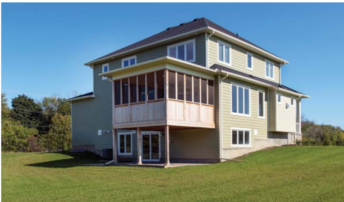
ABOVE: A rear screened porch really makes this home feel like a cottage, perfect for relaxing on a summer evening. LEFT: This home has great outdoor space, including a generous yard and covered terrace by The Ultimate Backyard.