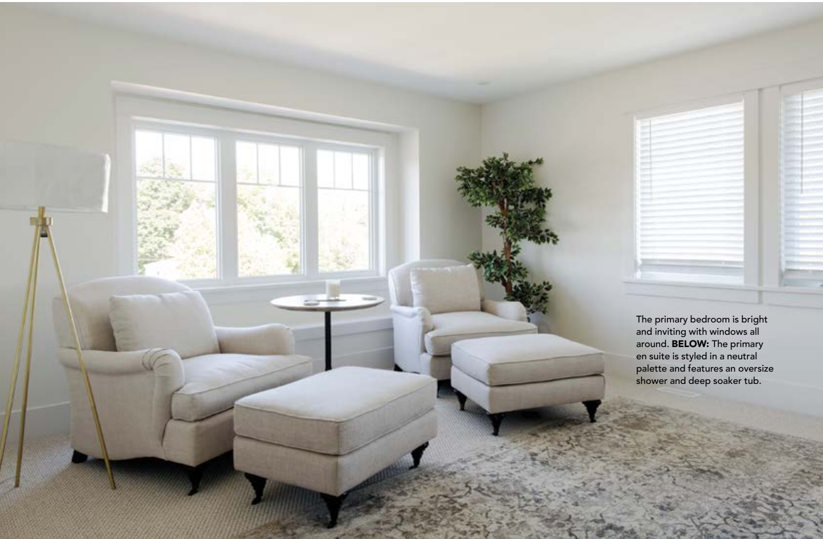
The primary bedroom is bright and inviting with windows all around. BELOW: The primary en suite is styled in a neutral palette and features an oversize shower and deep soaker tub.

The interior of the model home, aptly named The Brook , evokes a cottage-like feel with natural wood and stone finishes that reinforce the indoor-outdoor connection. Beautiful white oak hardwood floors from Gaylord Hardwood Flooring run throughout the main living areas and large windows flood the space with natural light.