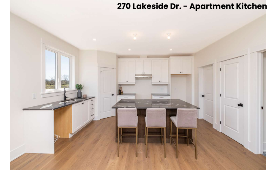
Share Expenses but Not Space!