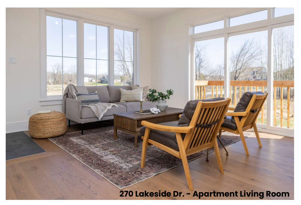
The apartment side of this 2-In-1 bungalow offers a full living room, full kitchen, full bedroom, full bathroom.